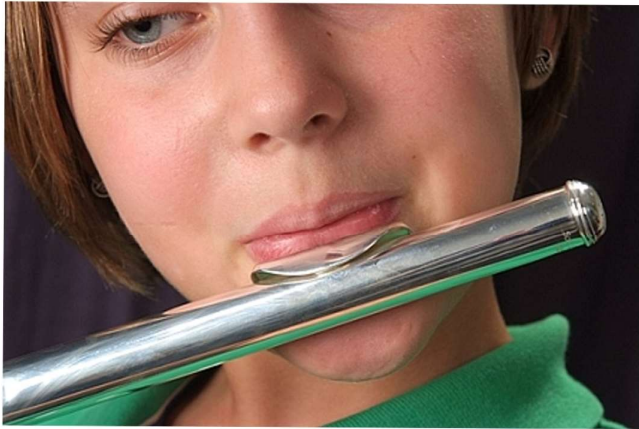
A good embouchure!!