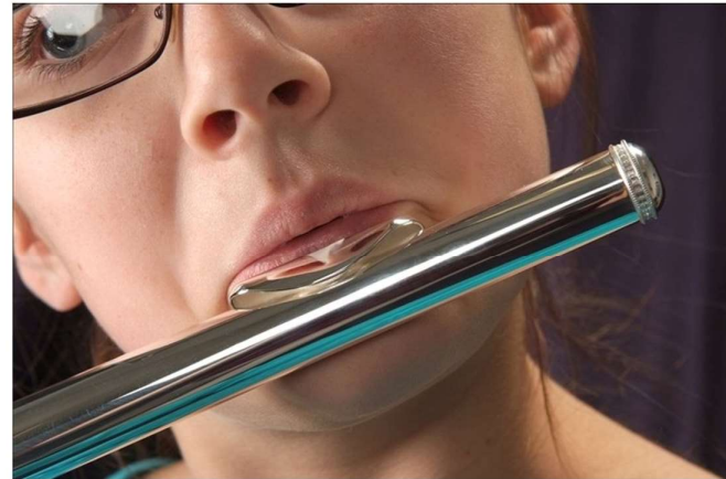
This is a fantastic flute embouchure. Notice the perfect triangle of water vapor formed from blowing with a focused air column.