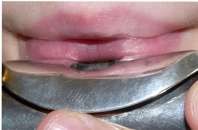
A Close-up of a Great Flute Embouchure.... though it would be even better with the corners of the lips slightly down.